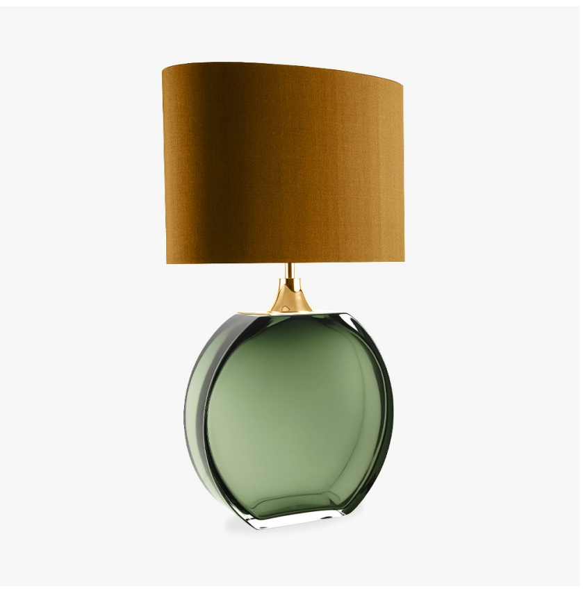
TL713-LA in Forest Green & Clear and Polished Gold with a 15" Oval Shade in Bennett Silks Dupion Silk 5018W-1095 Gold