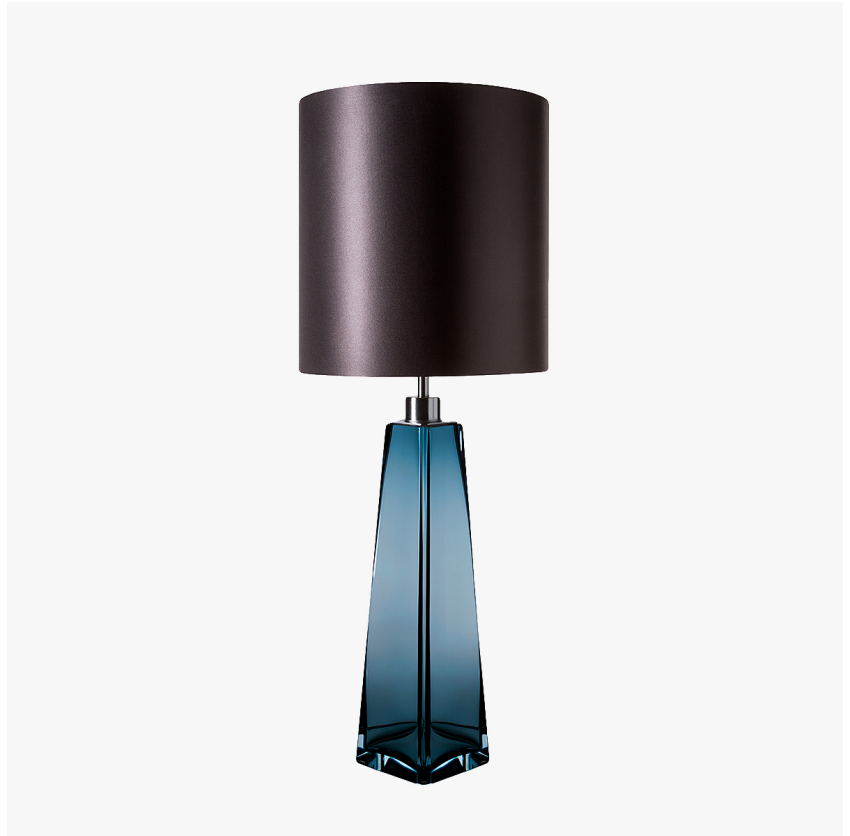
TL709 in Slate & Clear and Brushed Nickel with 11" Tall Drum in 1806W-570