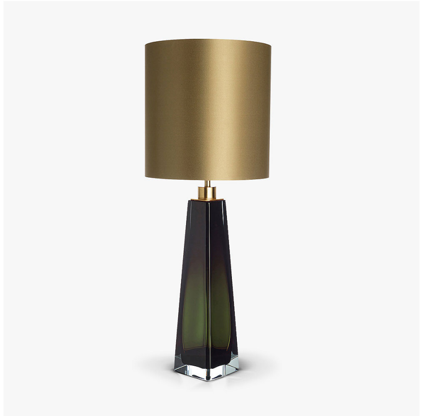
TL709 in Forest Green & Clear with Brushed Gold and 11" Tall Drum in 1806W-310 Timber Wolf