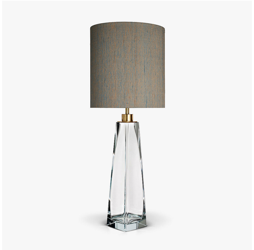
TL709 in Clear and Brushed Gold with 11" Tall Drum in Bennetts Silk Cochin