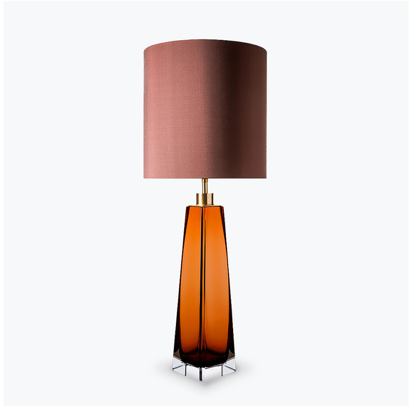
TL709 in Tobacco & Clear and Brushed Gold with a 11" Tall Drum in Dupion 5018W-306