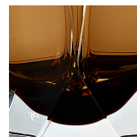
Tobacco & Clear