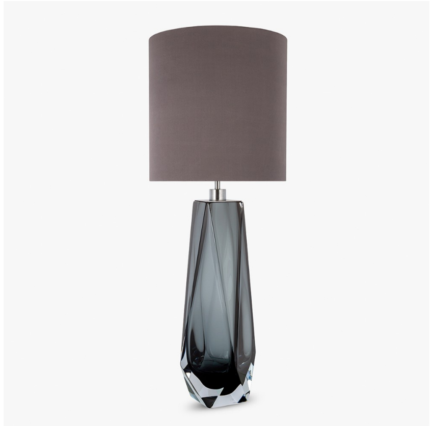
TL703-XL in Petrol Blue & Clear and Brushed Nickel with a 13" Tall Drum Shade in Bennett Silks Dupion Silk 5018W-86 Prussian