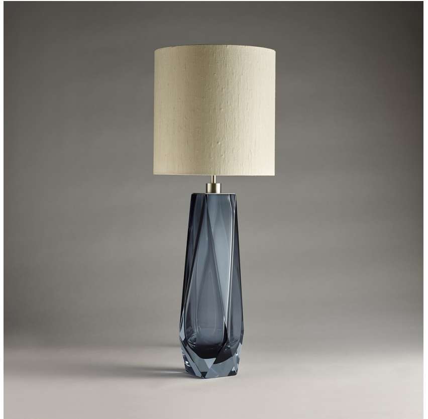
TL703-XL in Slate & Clear and Brushed Nickel with 13" Tall Drum in James Hare 31625-01 Ivory