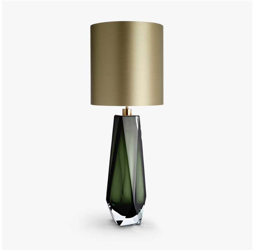
TL703-XL in Forest Green & Clear and Brushed Gold with a 13" Tall Drum Shade in Bennett Silks Crepe Satin 1806W-310 Timber Wolf