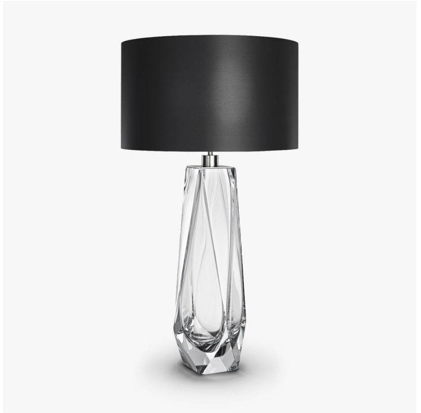
TL703-XL in Clear Murano Glass and Brushed Nickel with a 17" Short Drum Shade in 1806W Black