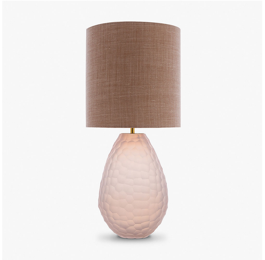
TL235 in Blush Pink Glass and Brushed Gold with an 11" Tall Drum Shade in (COM) Zoffany Cybelle Buff 332735