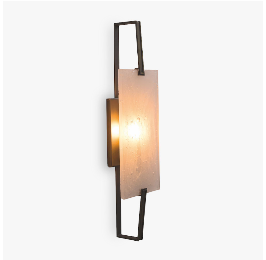
WL550 in 'dry Ice' Murano Glass and Brushed Dark Bronze

UL (Underwriters Laboratories) test certificates available for the USA - will incur a surcharge