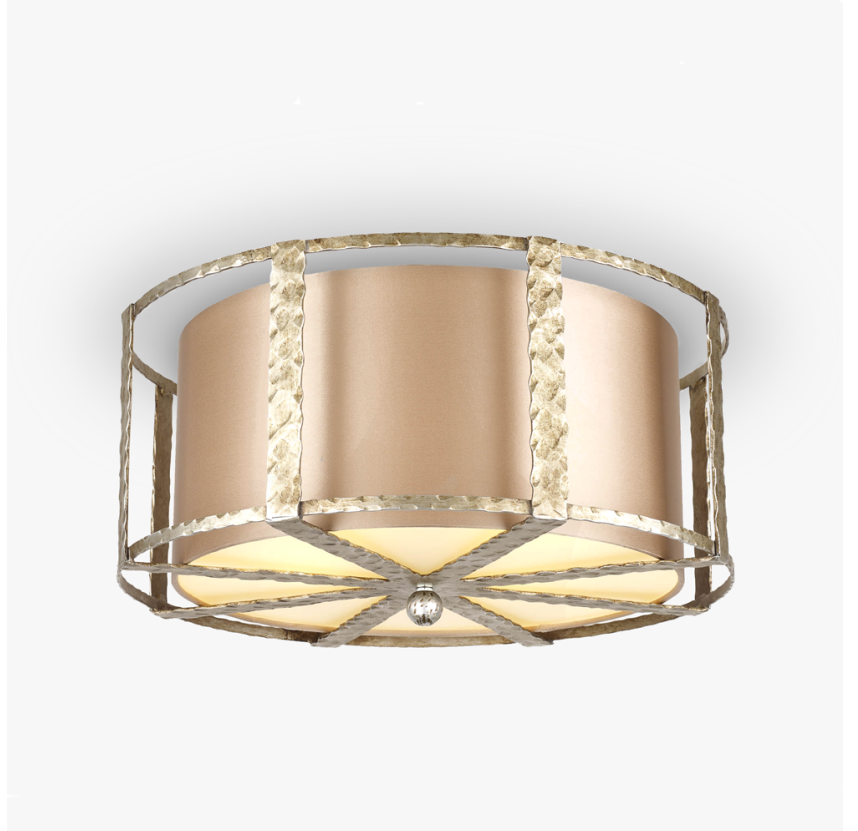
CL-50-FM in hammered antique silver with CL51-50-FM-SHADE in 1806W/ 012 Frosted Almond

Yacht Club Image not found or type unknown