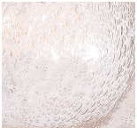
Clear Bubbled Glass