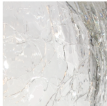
Clear Crackled Lead Crystal