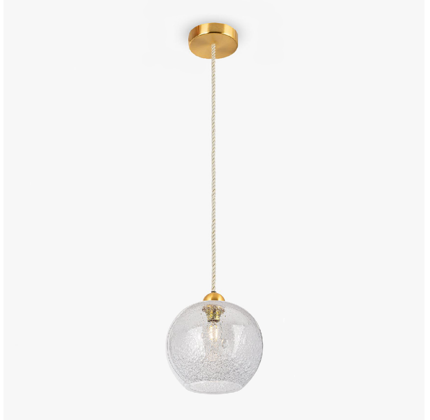
CL377 in Clear Soda Glass and Brushed Gold

The Contour Collection favourites, Arctic and Glacier have made a comeback this year bringing with them a new addition, Foss, as they form a triptych of pendants. Foss, meaning waterfall, is representative of rushing white water, hundreds of bubbles trapped within an effervescent glass dome.