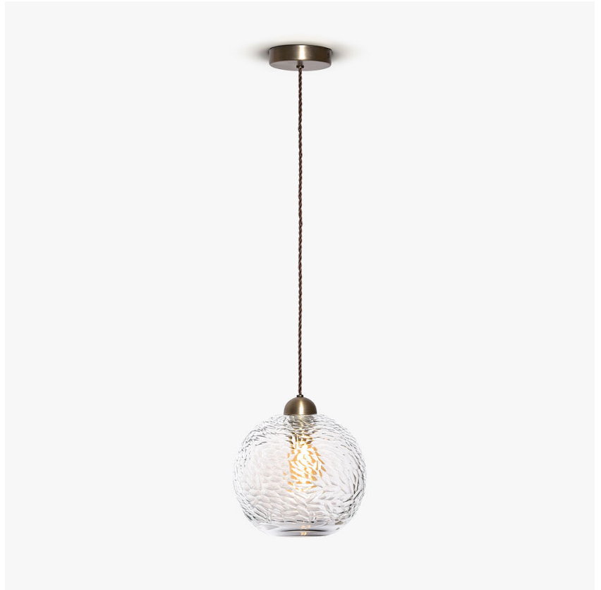
CL376 in Clear Battuto and Brushed Bronze and Brown Flex

The finest quality English lead crystal is carved in a fashion that mimics the patterns etched into the weather beaten walls of glacial caves. Drawing on the Murano glass craft of 'Battuto' whose name itself derives from the Italian word for 'beaten', our Glacier pendant and table lamp have every facet carved out individually by our English crystal experts. Use them individually or make use of our customisation service to group several together for a completely individual look.