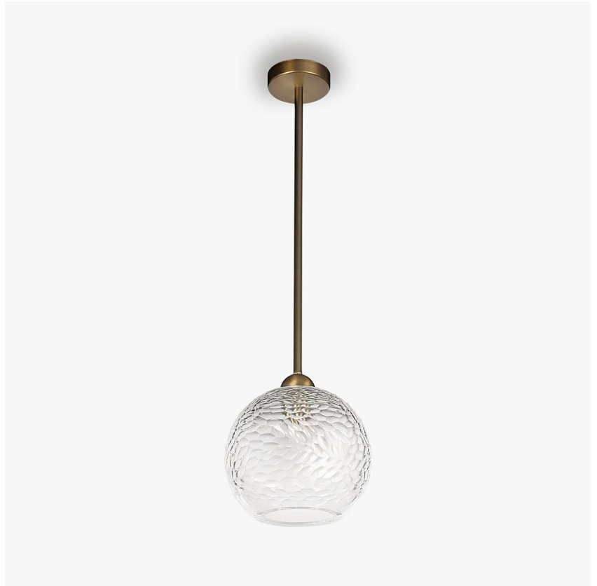
CL376 in Clear Battuto and Brushed Bronze

The finest quality English lead crystal is carved in a fashion that mimics the patterns etched into the weather beaten walls of glacial caves. Drawing on the Murano glass craft of 'Battuto' whose name itself derives from the Italian word for 'beaten', our Glacier pendant and table lamp have every facet carved out individually by our English crystal experts. Use them individually or make use of our customisation service to group several together for a completely individual look.