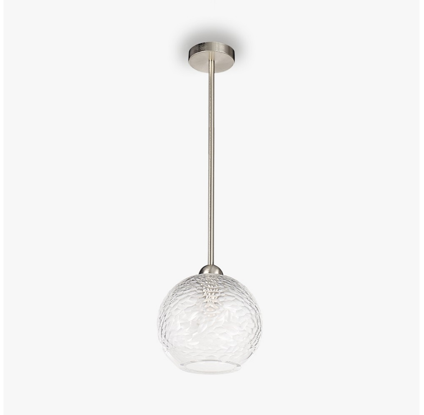
CL376 in Clear Battuto and Brushed Nickel

The finest quality English lead crystal is carved in a fashion that mimics the patterns etched into the weather beaten walls of glacial caves. Drawing on the Murano glass craft of 'Battuto' whose name itself derives from the Italian word for 'beaten', our Glacier pendant and table lamp have every facet carved out individually by our English crystal experts. Use them individually or make use of our customisation service to group several together for a completely individual look.