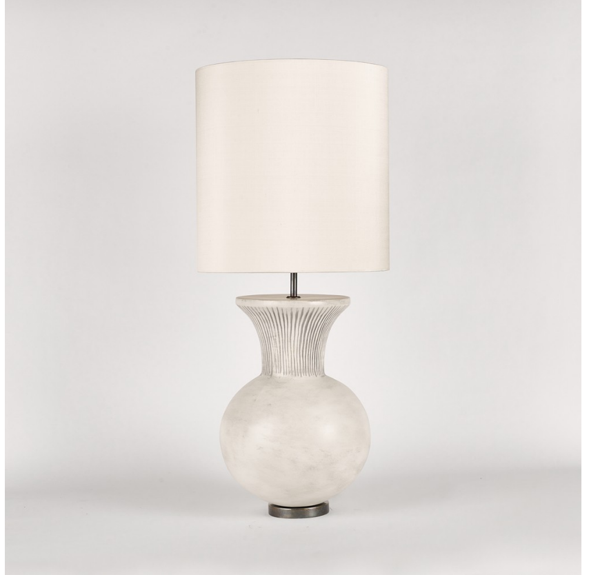
TL820 in Dolomite and Old English Brass with 14" Tall Drum Shade in Bennett's Dupion Silk Hint of Pink 5018W/50X