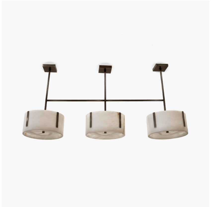
CL805 in Alabaster and Brushed Bronze