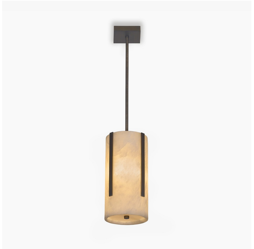
CL805-PEN in Alabaster and Brushed Bronze