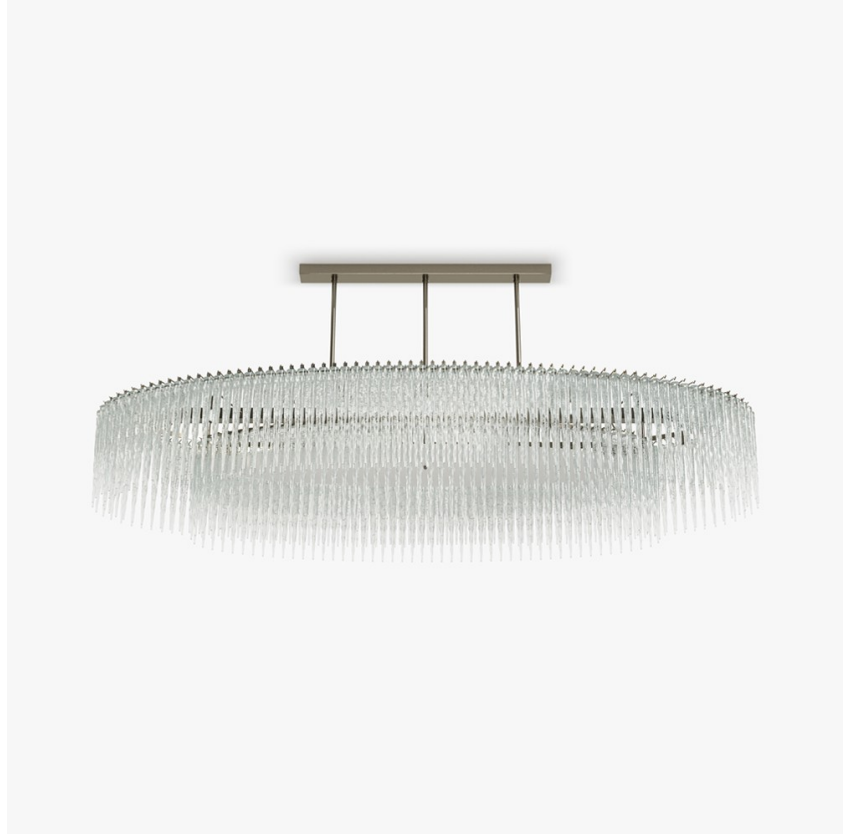
CL800-O-200 in Clear and Brushed Nickel

Elevate your space with the charm of the all-new Ice Oval Chandelier. An extension of one of our cherished designs from the Vega Collection, the Ice chandelier a reinvented masterpiece with a breathtaking twist. This two-tiered marvel unveils a stunning spectacle of suspended glass pendants, reminiscent of ethereal stalactites. Each droplet has been meticulously redesigned, now gracefully arranged in swirling layers that evoke a profound sense of tranquillity and serenity. With every gaze, a feeling of stillness washes over, creating an atmosphere of unruffled elegance. Experience a celestial dance of light and glass, as the Ice Oval Chandelier graces your space with a touch of cosmic splendour. Embrace the artistry of a timeless classic reborn and let the Ice Chandelier infuse your surroundings with a celestial aura. Elevate your ambiance with the epitome of sophistication and charm.