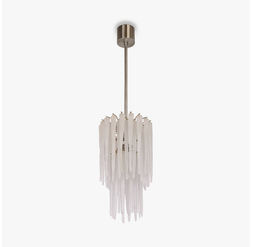
CL800-PEN in Satin and Brushed Nickel