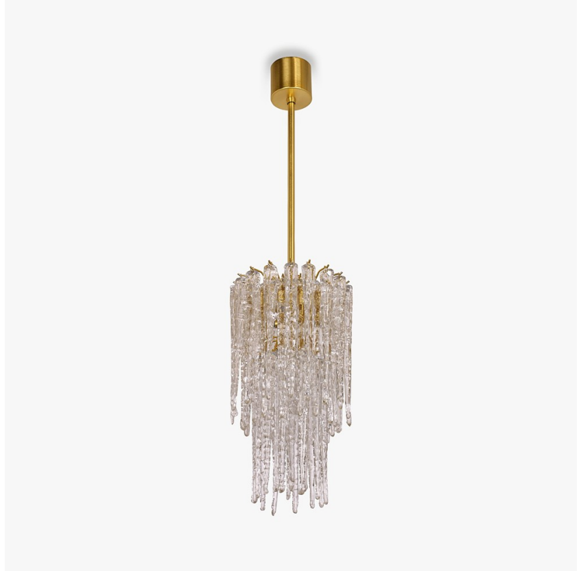
CL800-PEN in Satin and Brushed Gold