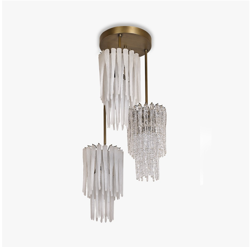
CL800-PEN-3 in Clear & Satin and Brushed Dark Bronze