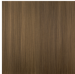
Antique Brushed Brass