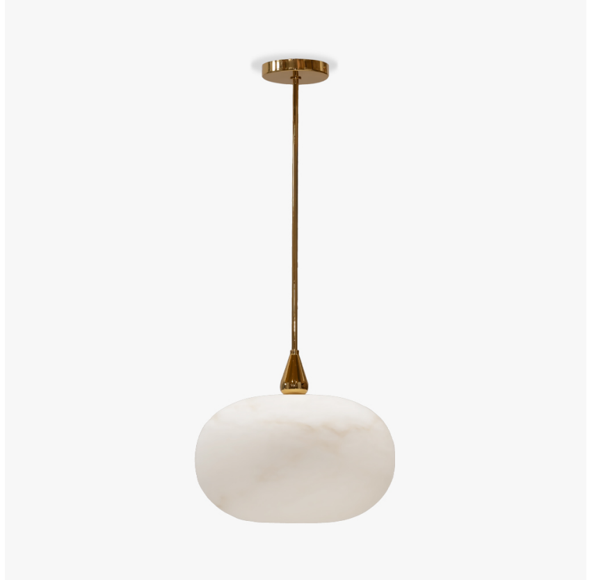
CL809 in Alabaster and Polished Gold