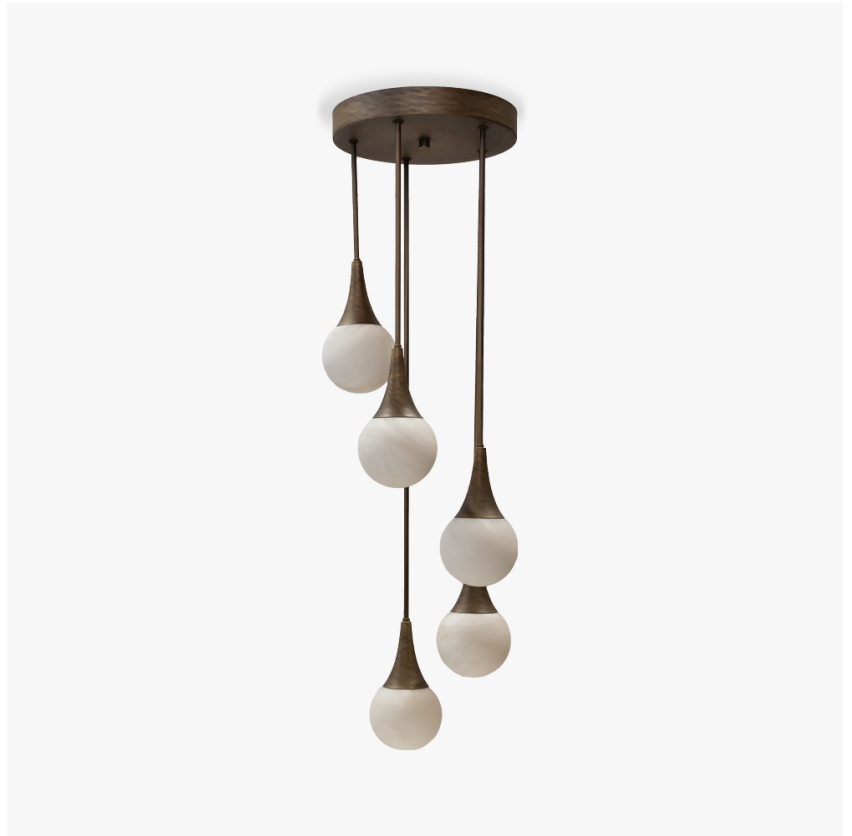
CL808-5 in Alabaster & Brushed Dark Bronze