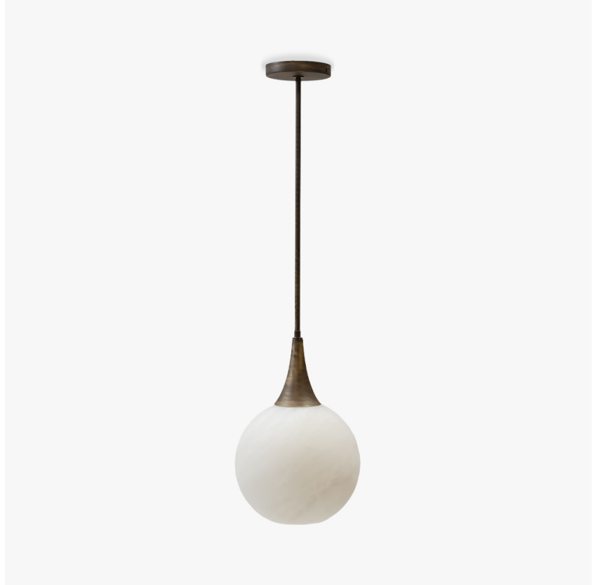
CL808-LA in Alabaster and Brushed Bronze