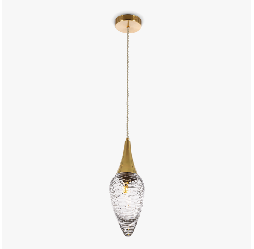
CL378 in clear lead crystal and polished brass with silver flex