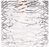
Clear Lead Crystal