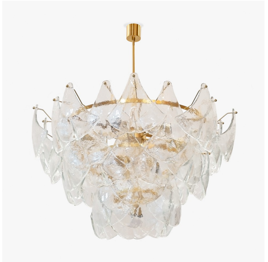
CL802-100 in Clear & Brushed Gold