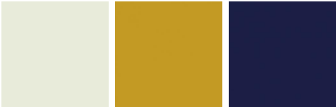
Parchment Mustard Admiral Blue