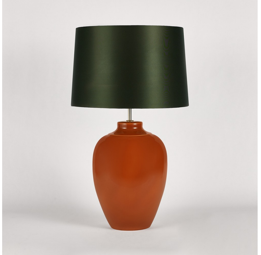
TL163 in Tabasco and Polished Brass with 16" Melton Shade in Bennett's Crepe Satin Dill 1806W/120

The Mela table lamp, which takes its name from the Italian word for 'apple', is a rejuvenation of the traditional urn shape with six new finishes to adorn its voluptuous form. This creation is truly the apple of our eye.