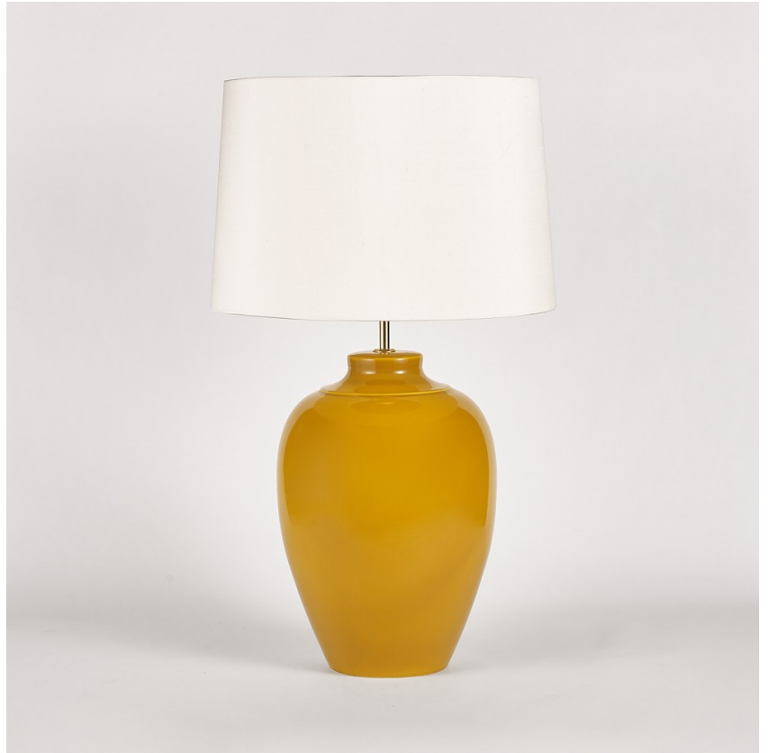
TL163 in Mustard and Polished Brass with 16" Melton Shade in Bennett's Dupion Silk Ivory 5018W/91

The Mela table lamp, which takes its name from the Italian word for 'apple', is a rejuvenation of the traditional urn shape with six new finishes to adorn its voluptuous form. This creation is truly the apple of our eye.