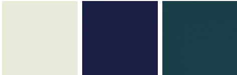
Parchment Admiral Blue Dark Teal