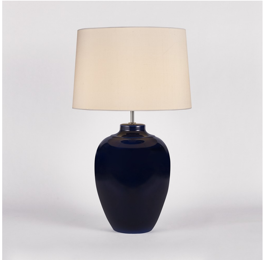
TL163 in Admiral Blue and Polished Nickel with 16" Melton Shade in Bennett's Dupion Silk Ivory 5018W/91

The Mela table lamp, which takes its name from the Italian word for 'apple', is a rejuvenation of the traditional urn shape with six new finishes to adorn its voluptuous form. This creation is truly the apple of our eye.