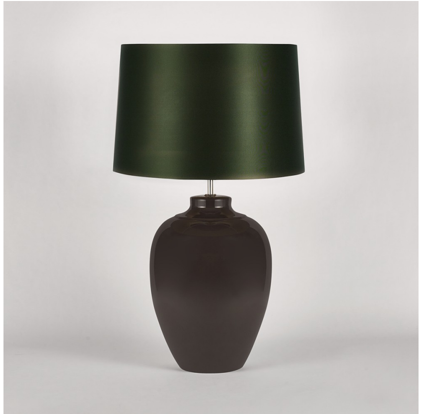
TL163 in Beluga and Polished Nickel with 16" Melton Shade in Bennett's Crepe Satin Dill 1806W/120

The Mela table lamp, which takes its name from the Italian word for 'apple', is a rejuvenation of the traditional urn shape with six new finishes to adorn its voluptuous form. This creation is truly the apple of our eye.