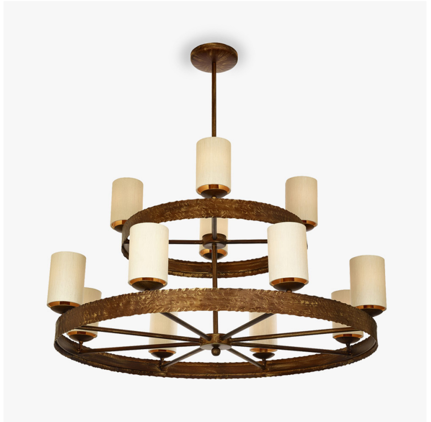
CL50-8+4 in Hammered Decorated Bronze with 12 X 4 Inch Tall Drum Shades in 3998/ 41 Beige

UL (Underwriters Laboratories) test certificates available for the USA - will incur a surcharge IEC (International Electrotechnical Commission) test certificates available - will incur a surcharge