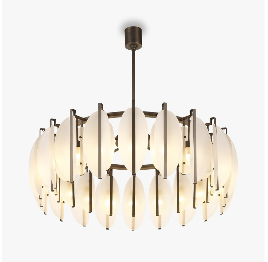
CL852 in Satin and Brushed Dark Bronze