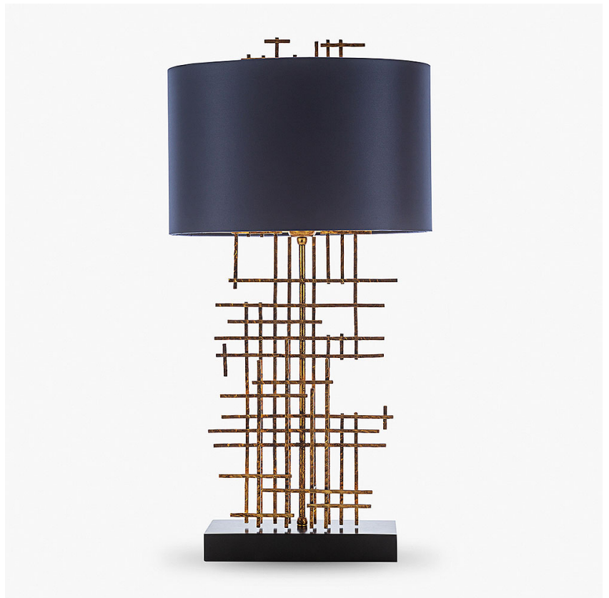
TL59 in Antique Gold Leaf with an Ebony Resin Base with a 15" Oval Drum Shade in Crepe Satin 1806W/ 86 Prussian