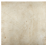
Antique Silver Leaf