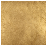
Antique Gold Leaf