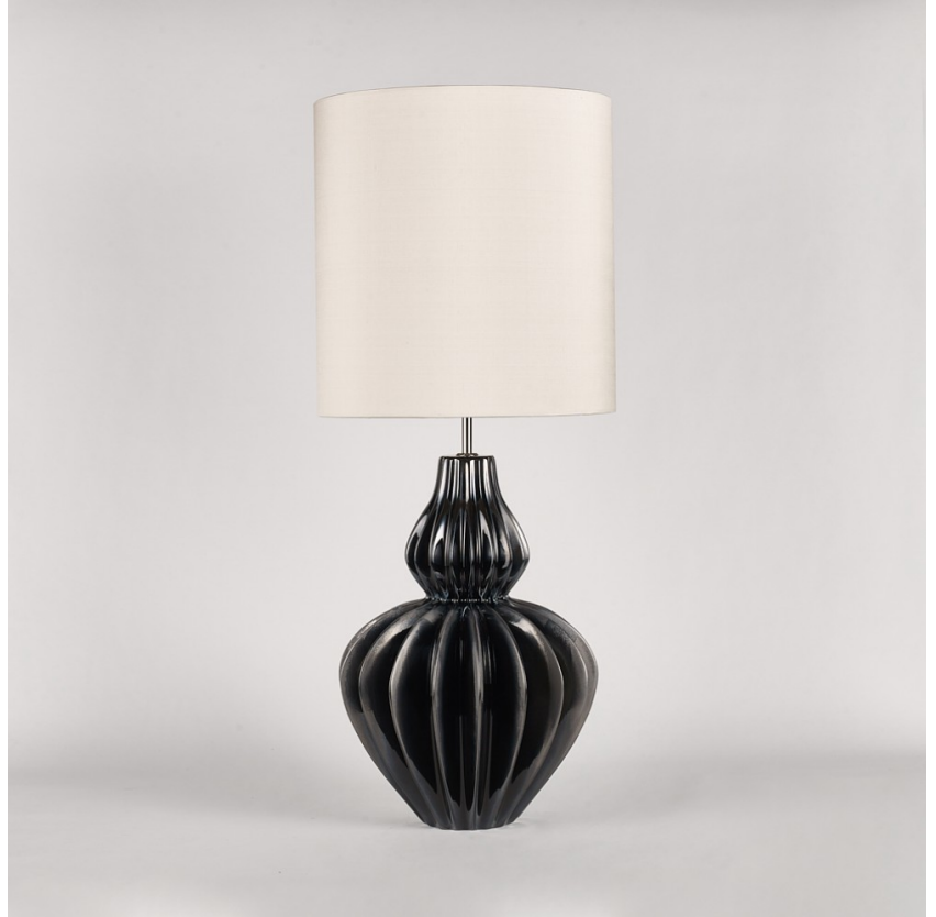
TL825 in Oil and Polished Nickel with 14" Tall Drum Shade in Bennett's Dupion Silk Hint of Pink 5018/50X

Required modifications for use on yachts - lacquer applied to all metal components, "sea rod" through centre to secure base to surfaces, with the cable exit through bottom of the base.