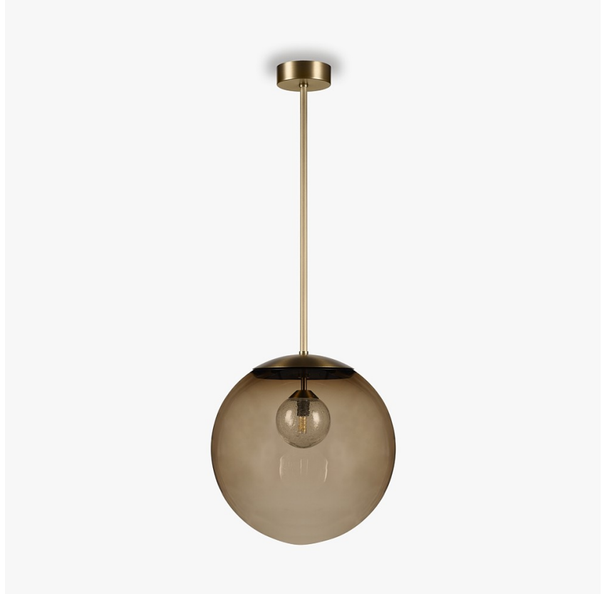
CL854-PEN in Cacao and Brushed Bronze

The Orbis pendant lights combine timeless sophistication with modern artistry. Featuring meticulously crafted glass spheres with a beautiful inner glass globe design feature, inspired by celestial orbits and the beauty of planetary motion, the Orbis Pendant evokes a sense of weightless elegance, with its luminous glass spheres appearing to float effortlessly. These pendants are available in three finishes: Olive, Cacao, and Clear. The pendants embody the perfect balance of design and functionality, making them an exceptional addition to any décor. Whether suspended individually for understated elegance or clustered together to create a dramatic statement, the Orbis Pendants radiate a warm and inviting glow. Perfect for living areas, dining spaces, or grand entrances, they add a contemporary touch while enhancing the atmosphere of any interior.