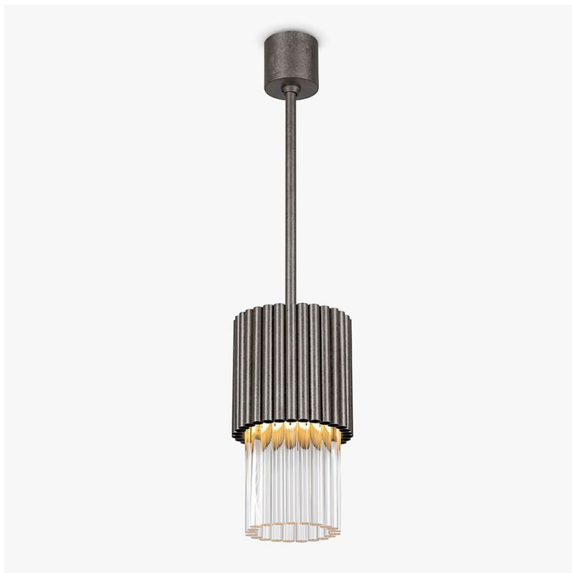
CL108-PEN in Clear and Stippled Silver

IEC (International Electrotechnical Commission) test certificates available - will incur a surcharge