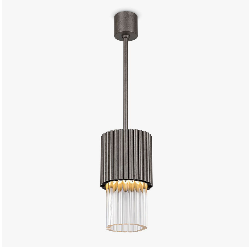
CL108-PEN in Clear Lucite Rods and Stippled Silver Rods

IEC (International Electrotechnical Commission) test certificates available - will incur a surcharge