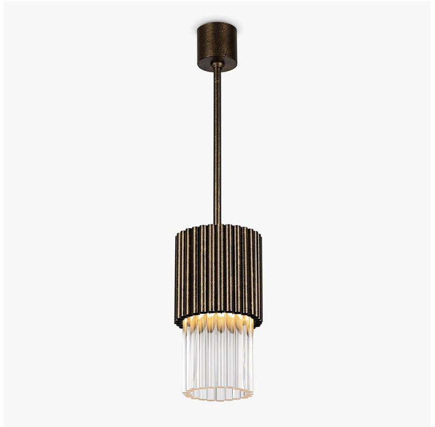
CL108-PEN in Clear Lucite Rods and Stippled Bronze Rods

IEC (International Electrotechnical Commission) test certificates available - will incur a surcharge