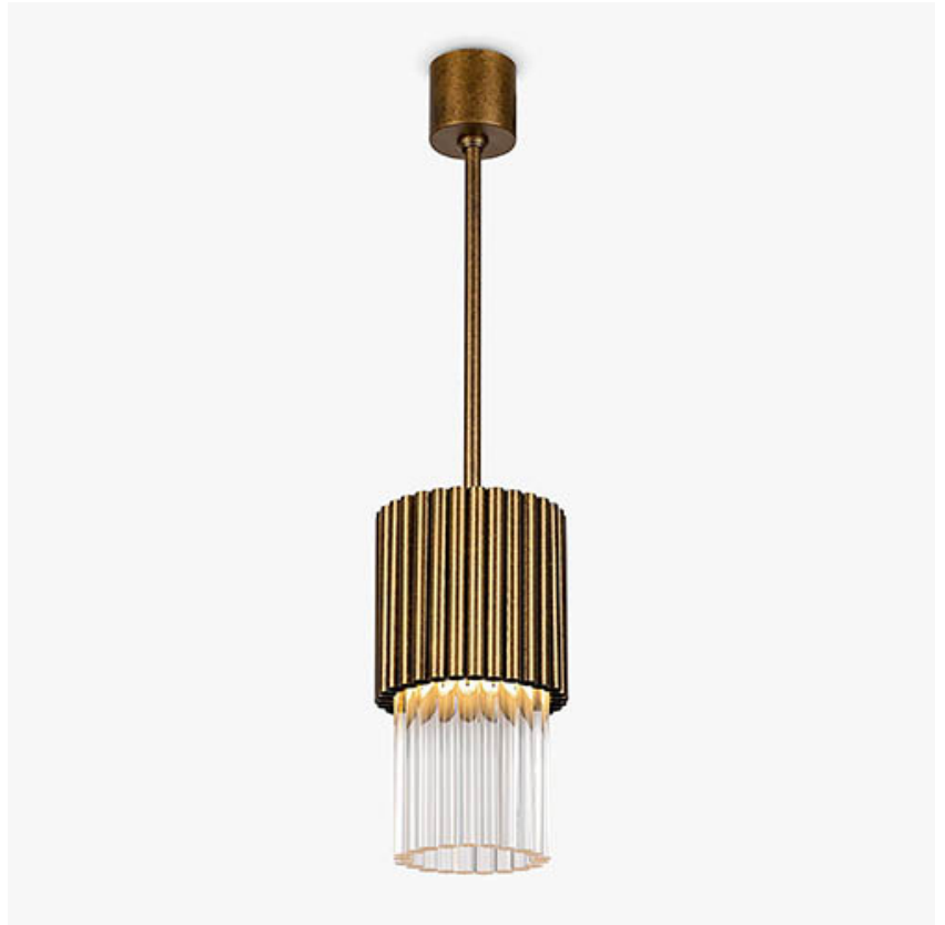
CL108-PEN in Clear Lucite Rods and Stippled Gold Rods

IEC (International Electrotechnical Commission) test certificates available - will incur a surcharge