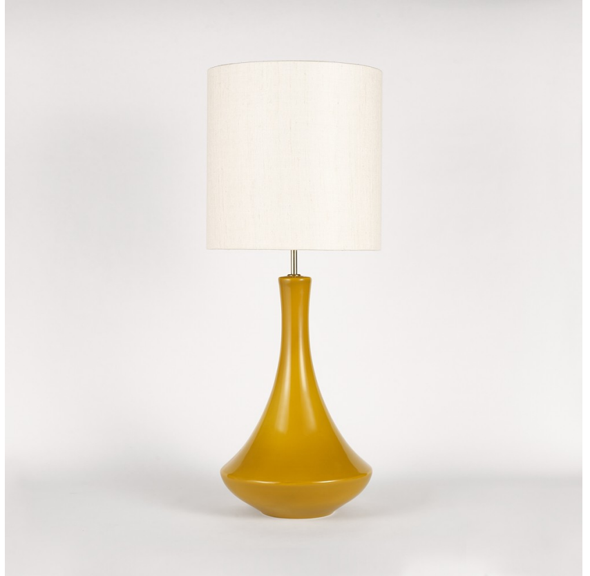
TL162 in Mustard and Polished Brass with 13" Tall Drum Shade in James Hare Vienne Silk Chalk 31458/01

The fruit from the tree of the Pyrus genus – the humble pear, the perfect name for our latest ceramic design. Curvaceous but sleek, our Pyrus lamp renews this classic pear shape, creating a chic outline for superior interior styling. Illuminated by six new glossy glazes, this piece is as versatile as it is vivacious.