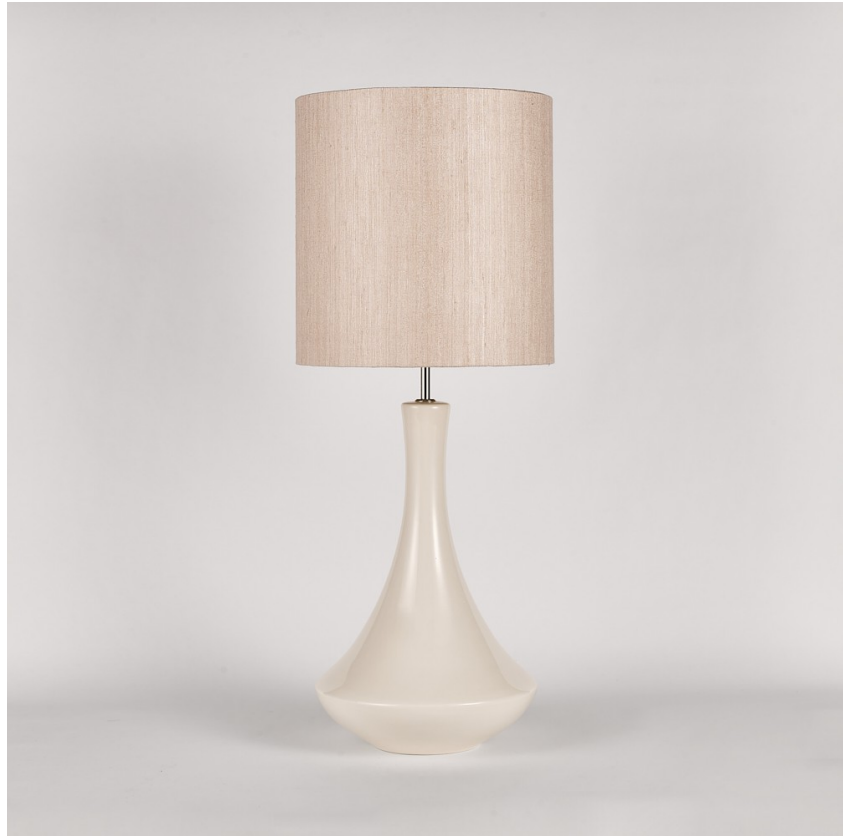
TL162 in Parchment and Polished Nickel with 13" Tall Drum Shade in James Hare Vyne Silk Rose Quartz 31625/10

The fruit from the tree of the Pyrus genus – the humble pear, the perfect name for our latest ceramic design. Curvaceous but sleek, our Pyrus lamp renews this classic pear shape, creating a chic outline for superior interior styling. Illuminated by six new glossy glazes, this piece is as versatile as it is vivacious.