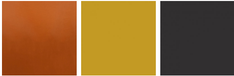
Tabasco Mustard Beluga