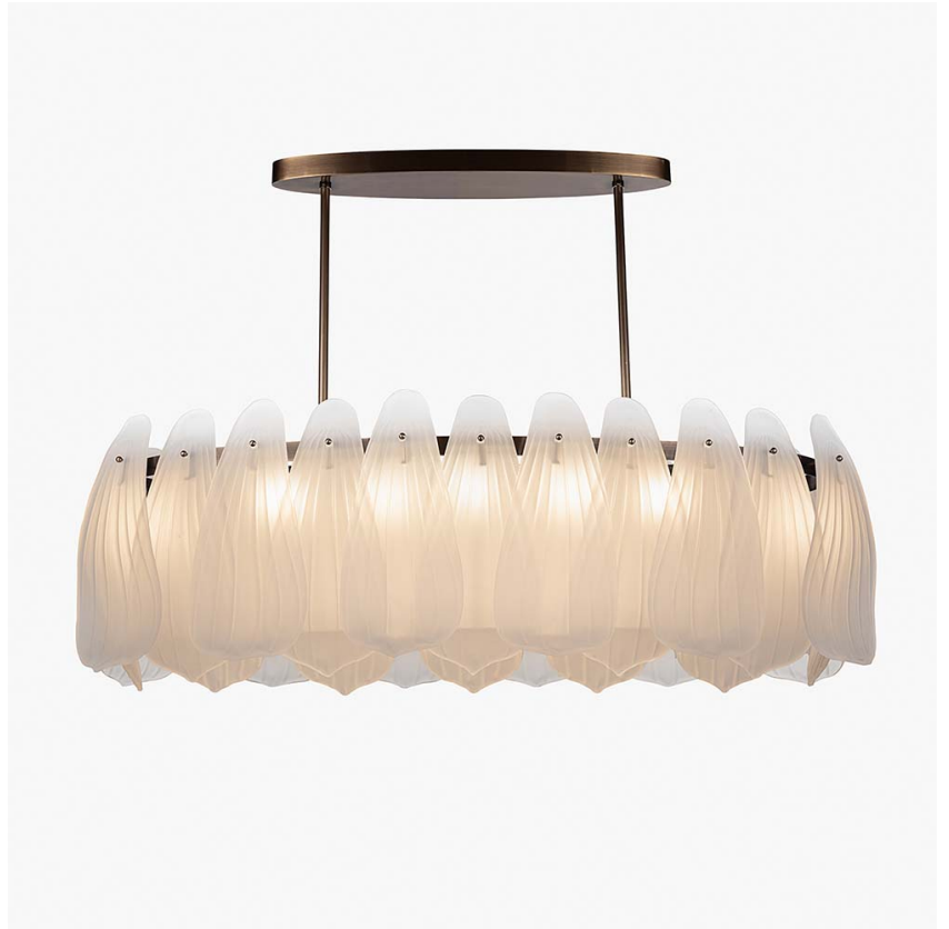
CL214-125 in Satin Glass and Brushed Light Bronze