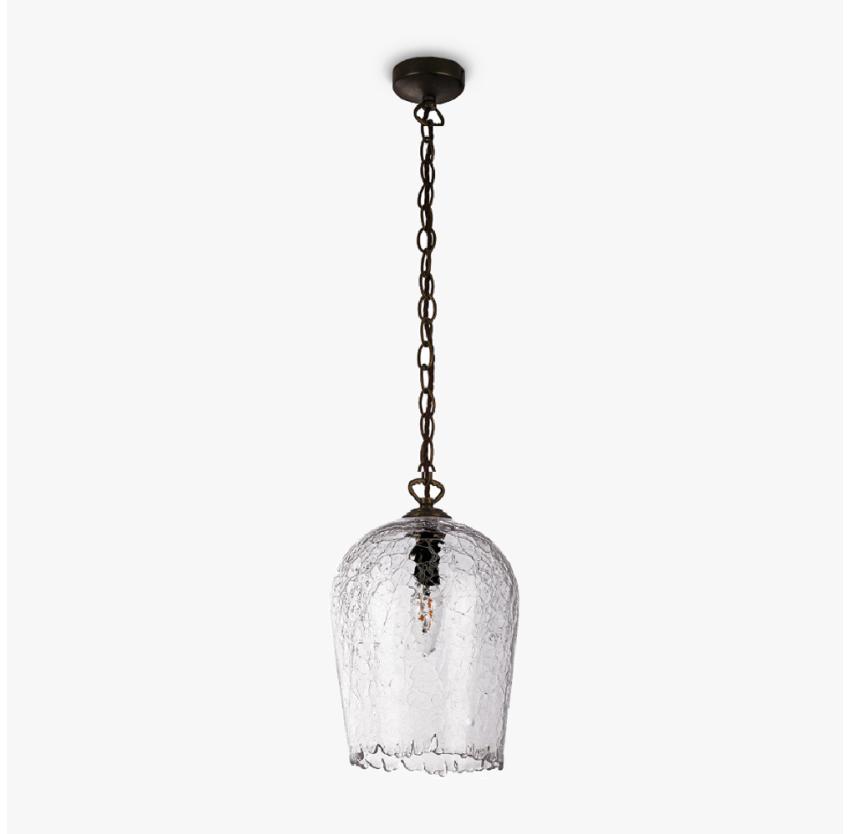
CL52-LA in Clear Crackled Glass and Old English Brass Chain