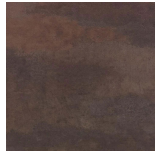
Old English Brass