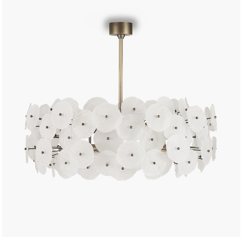
CL207-SM in Satin Glass and Brushed Bronze