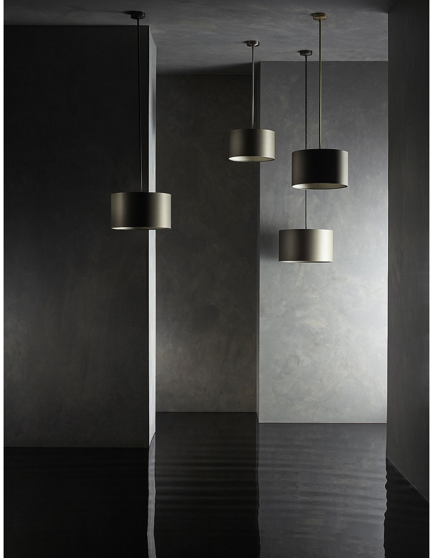
CL03 in brushed brass with 16" drum shade in crepe satin 1806W/310 Timberwolf

Yacht Club Image not found or type unknown