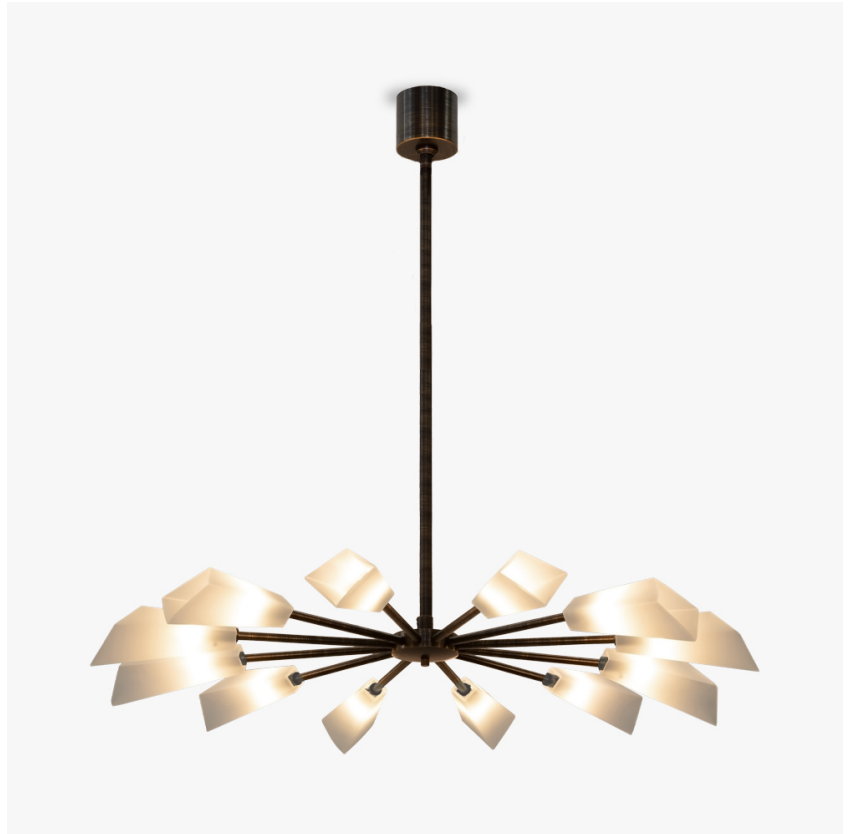
CL804-100 in Satin Glass and Brushed Bronze