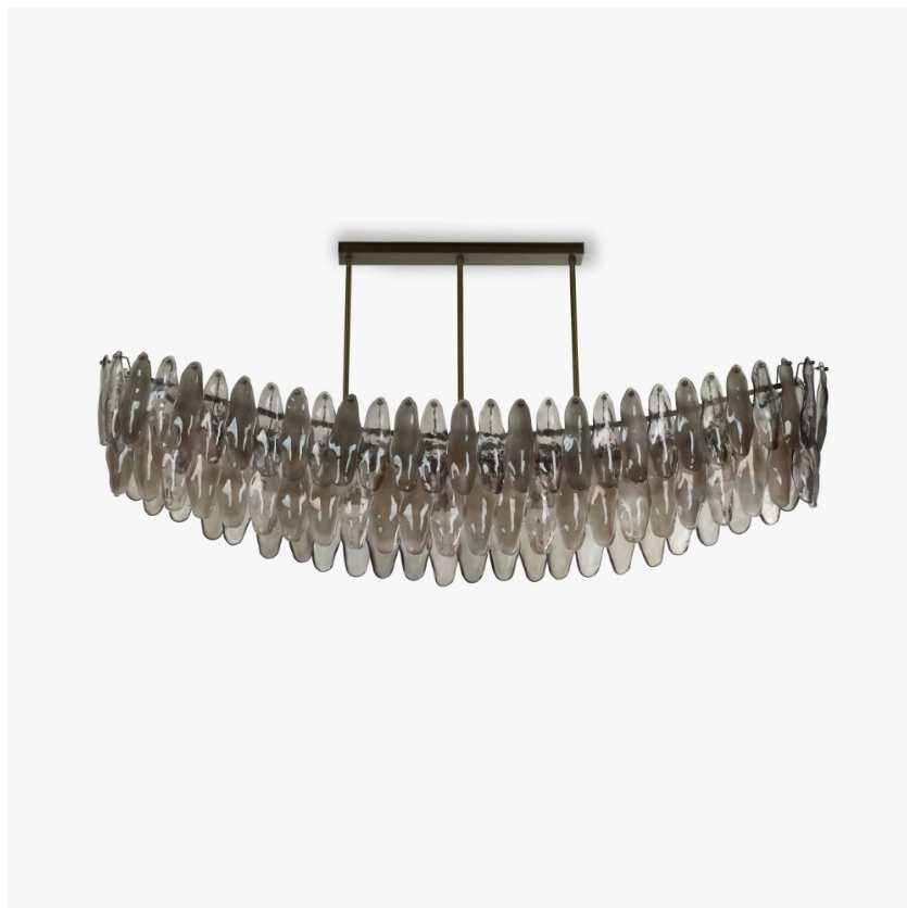
CL850-CO in Bronze and Bronze Satin with Brushed Bronze

The presence of energy and movement cannot always be explained; a phantom, a mirage or a ghost. Our Spectre range takes on a somewhat ethereal form with its amorphous shapes and diaphanous presence. Created from a new suspended glass fixing, the Spectre ceiling lights appear to hover in mid-air and hint at the vestige of energy where life may once have been. Offered in a mix of clear glass with spectral satin glass elements, the dappled light effect that this creates disrupts any defined outline and produces a softness and a gentle vision for your interior setting. In a design first for Bella Figura, this variation of the classic round design is available in a unique curved oval shape that evokes images of an other-worldly ghost ship cutting through uncharted waters.