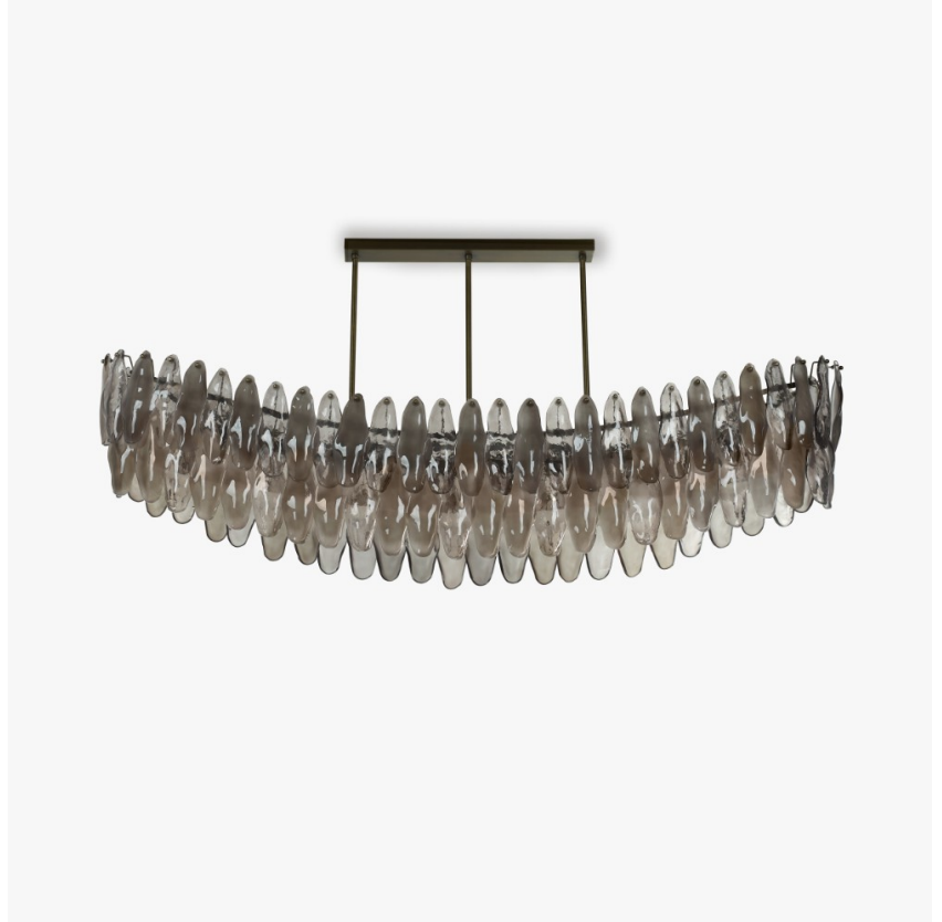
CL850-CO in Bronze and Bronze Satin with Brushed Bronze

The presence of energy and movement cannot always be explained; a phantom, a mirage or a ghost. Our Spectre range takes on a somewhat ethereal form with its amorphous shapes and diaphanous presence. Created from a new suspended glass fixing, the Spectre ceiling lights appear to hover in mid-air and hint at the vestige of energy where life may once have been. Offered in a mix of clear glass with spectral satin glass elements, the dappled light effect that this creates disrupts any defined outline and produces a softness and a gentle vision for your interior setting. In a design first for Bella Figura, this variation of the classic round design is available in a unique curved oval shape that evokes images of an other-worldly ghost ship cutting through uncharted waters.