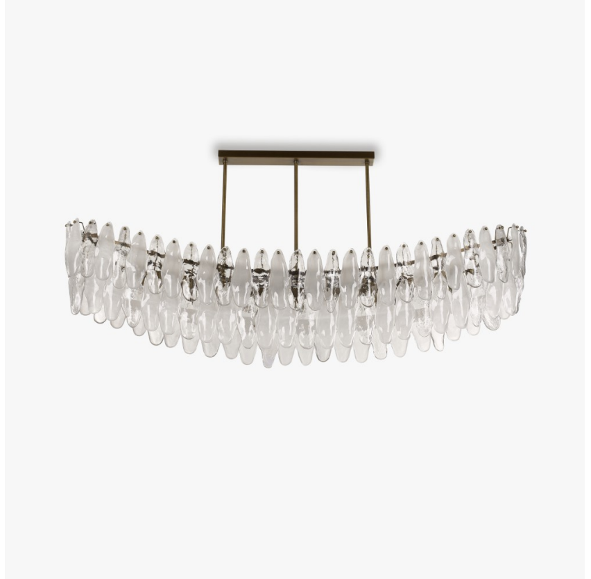
CL850-CO in Clear and Clear Satin with Brushed Bronze

The presence of energy and movement cannot always be explained; a phantom, a mirage or a ghost. Our Spectre range takes on a somewhat ethereal form with its amorphous shapes and diaphanous presence. Created from a new suspended glass fixing, the Spectre ceiling lights appear to hover in mid-air and hint at the vestige of energy where life may once have been. Offered in a mix of clear glass with spectral satin glass elements, the dappled light effect that this creates disrupts any defined outline and produces a softness and a gentle vision for your interior setting. In a design first for Bella Figura, this variation of the classic round design is available in a unique curved oval shape that evokes images of an other-worldly ghost ship cutting through uncharted waters.