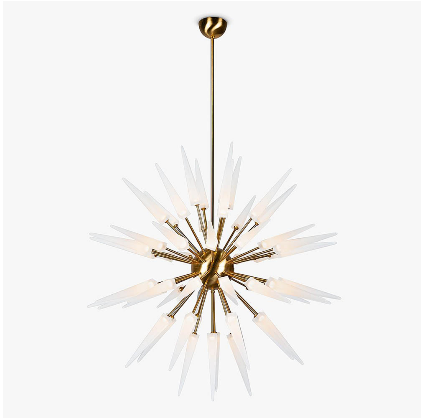
CL65-120 in satin Murano glass and brushed gold

UL (Underwriters Laboratories) test certificates available for the USA - will incur a surcharge IEC (International Electrotechnical Commission) test certificates available - will incur a surcharge