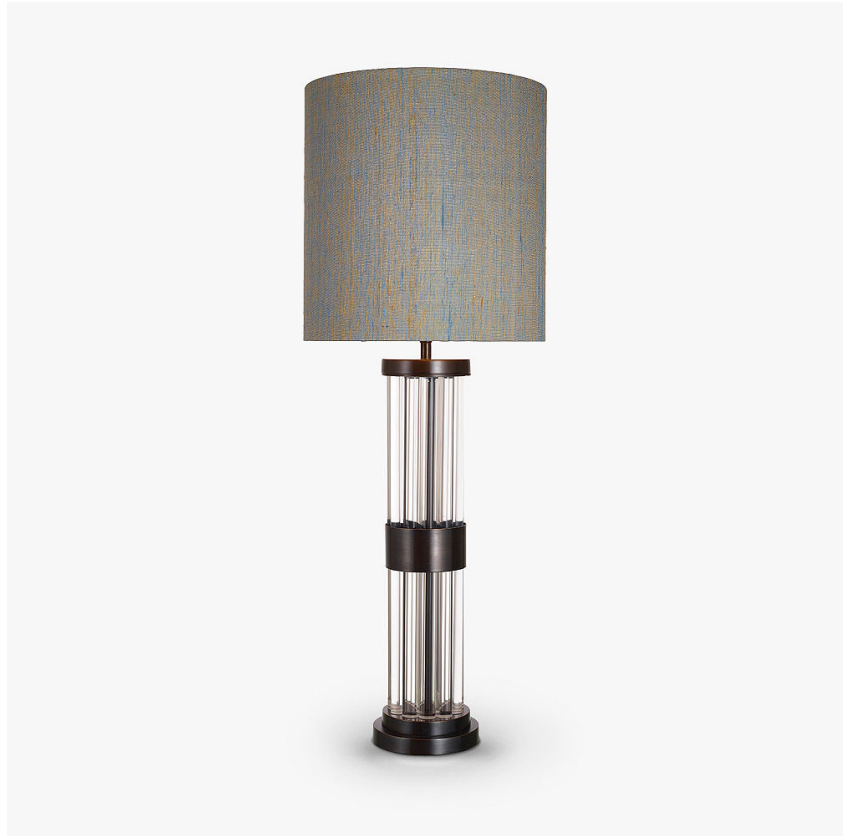
TL121 in Clear and Bronze with an 11" Tall Drum in Cochin 8018W-90