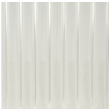
Clear Lucite Rods