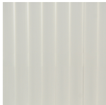
Frosted Lucite Rods