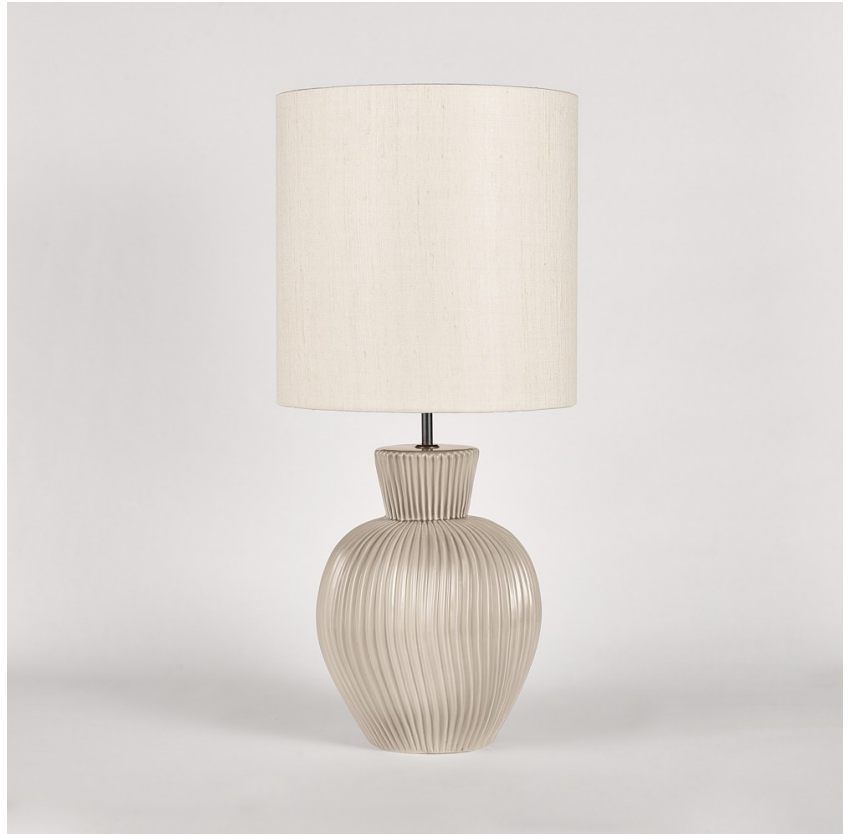
TL160 in Earl Grey and Old English Brass with 13" Tall Drum Shade in James Hare Vienne Silk Chalk 31458/01